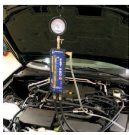
Use in vehicle

The test device is normally connected directly in the stream of fuel. An installation point located along the fuel supply line close to the fuel rail permits for example precise measurement of the fuel pressure and flow rate within the rail.